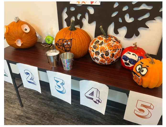
Rivendale pumpkins entered into the decorating contest.

Rivendale Institute of Learning and Center for Autism loves getting in the spirit of fall and Halloween. Every year, they host a pumpkin decorating contest for their students. This year the submissions were extremely creative and fun. There were many creative pumpkins ranging from a puffer fish to a brightly colored bird. The children love doing this contest every year as it lets their artistic spirits shine bright. The puffer fish pumpkin took first place. The students also got to show off their imaginative costumes in the Halloween costume parade. Many departments came together to be at trick-or-treat stations for the kids. It was a fun time for everyone and a great opportunity for the kids to practice their trick-or-treating skills before the big night.