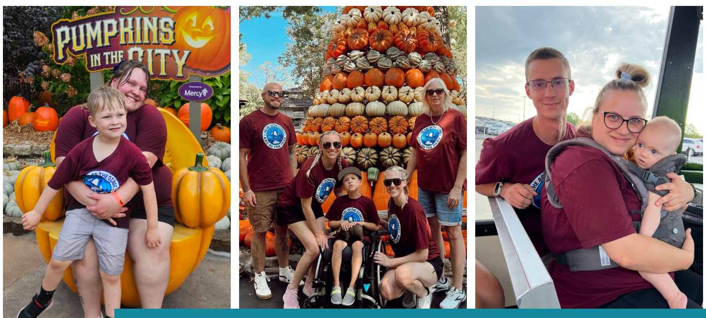
Staff members enjoying "Arc in the Park" with co-workers and families.