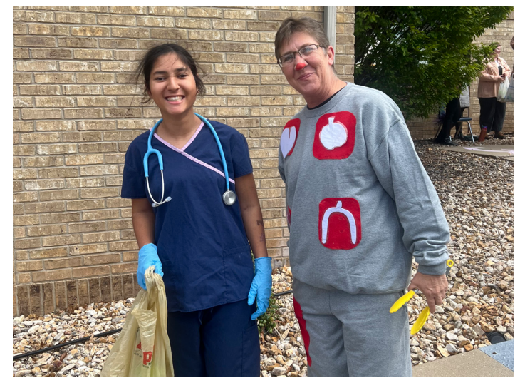
First place winners of the costume contest.