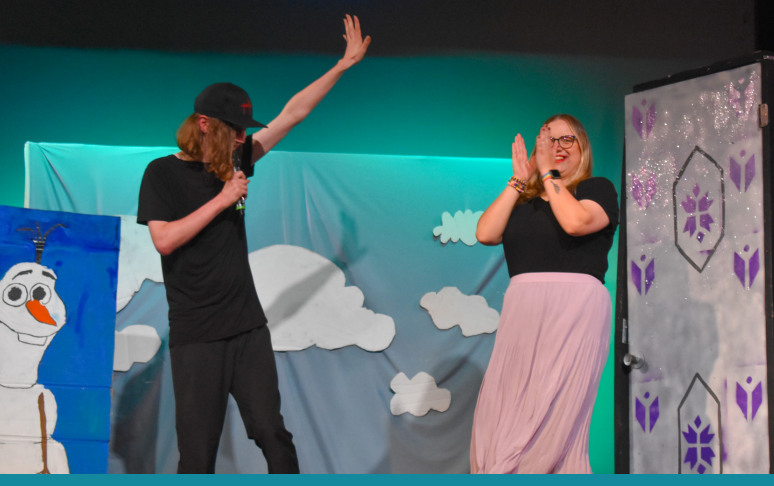
SOAR client and staff duo, performing to Disney's "Let it Go".