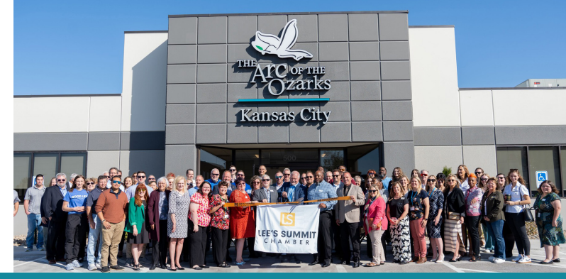
The Arc of the Ozarks and Lee's Summit Chamber staff "cutting the ribbon".

The new facility is located at 500 NE Colbern Road, Lee's Summit, Mo.