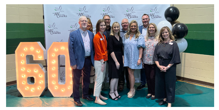
The Arc of the Ozarks Executive team.

While much has been achieved, the need remains significant. The Arc of the Ozarks is committed to meeting the evolving needs of individuals and families, and we look forward to continuing our work to make a difference for many years to come. Thank you for 60 years of unwavering support.