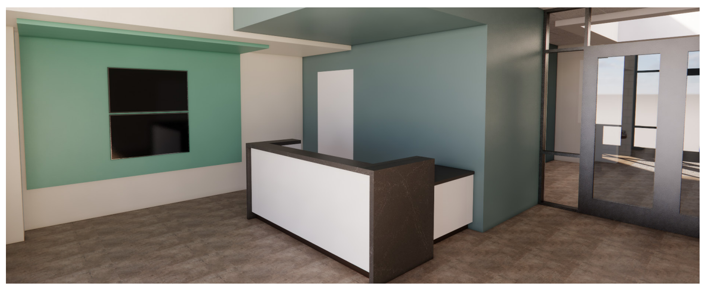
The Arc of the Ozarks Timothy Grant Newport Activity Center reception area rendering.

Phase one will be completed by the end of December. Phase two will include updated laundry, restrooms and showers for the pool and an added sensory room off the gym. These additions will help us better serve the needs of the community that use our space. These upgrades will be complete around the end of March 2025. We appreciate your patience and "pardon our progress".