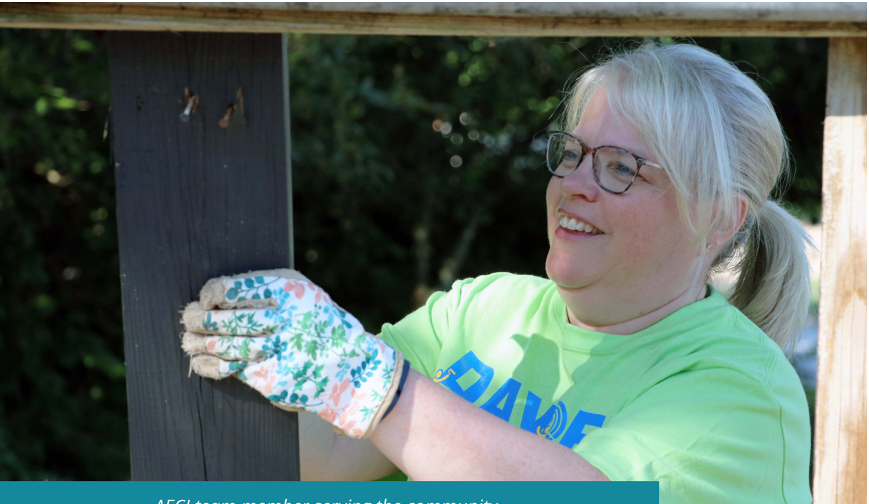
AECI team member serving the community.