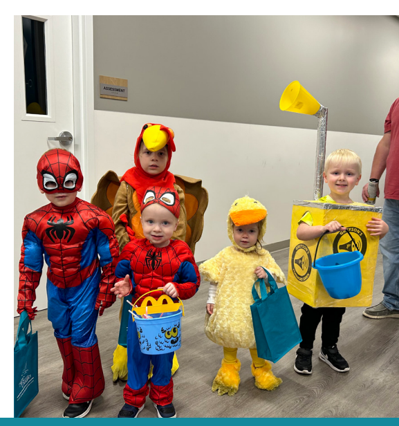
Trick-or-treaters enjoying the sensory safe trick-or-treat.

their doors to make the environment feel fun and special for everyone! Students from several different college programs came to volunteer and were a big part of the event's success!" This year's event shattered previous attendance records with 859 participants that ranged from very young children to adults. The Arc is proud to provide so many families with a great evening, plus an environment that was just right for their sensory needs!