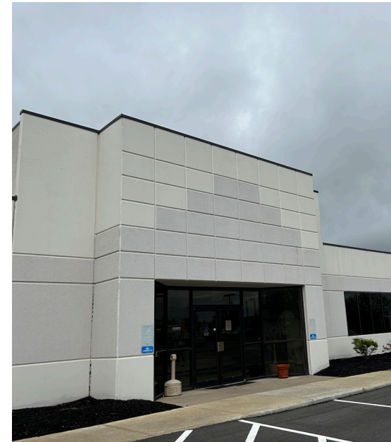
The new building acquired in Lee's Summit.

Both the Kansas City Chiefs and The Arc of the Ozarks celebrated big wins this winter! While the Chiefs players may get a ring, The Arc is relocating and expanding services.