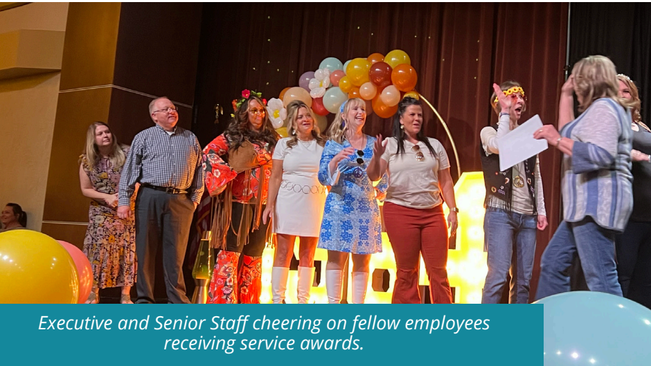
Executive and Senior Staff cheering on fellow employees receiving service awards.