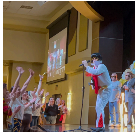
The Arc's one and only, Elvis Presley.