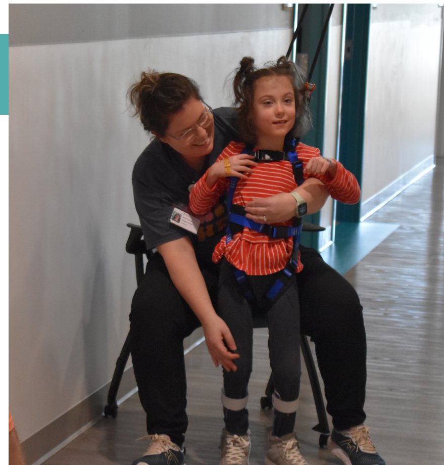
Therapist and patient utilizing the track system at the new center.