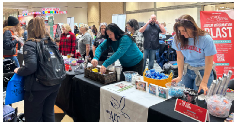
The Arc of the Ozarks employees handing out resources at The Arc booth.