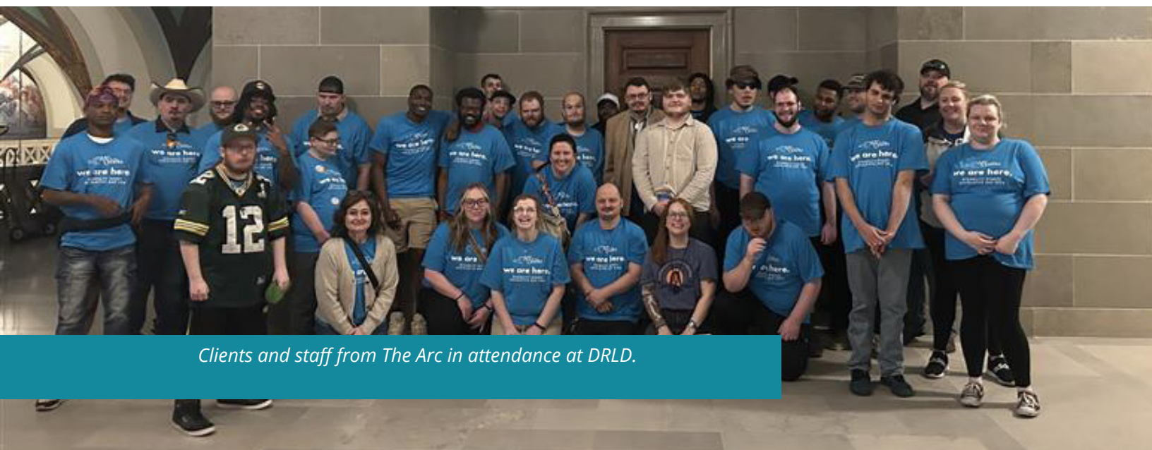
Clients and staff from The Arc in attendance at DRLD.