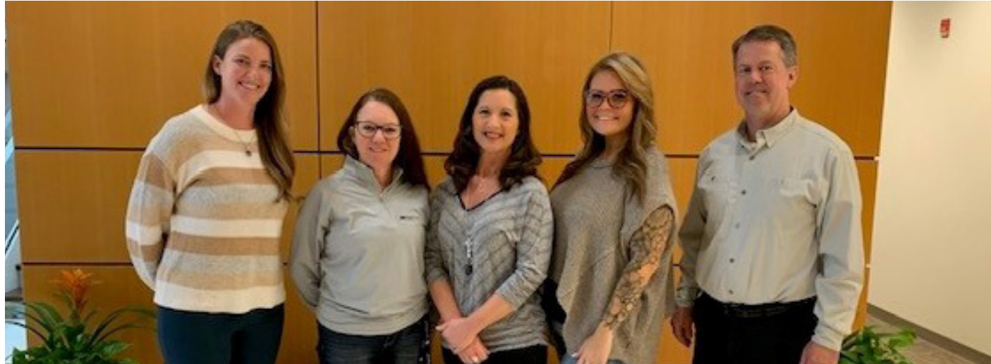
Marsh McLennan Agency Team.