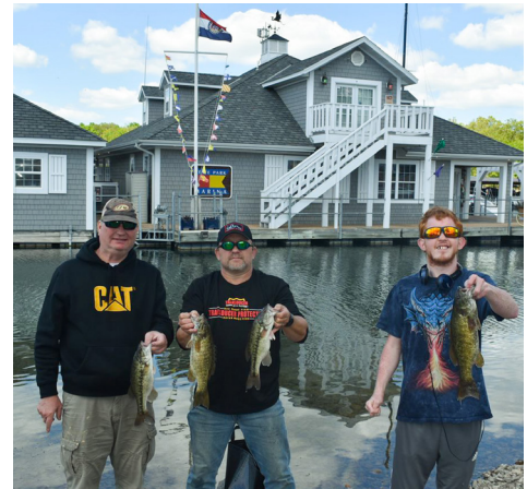
Participants showing their catches of the day.

The Open Buddy Bass Tournament was held on April 29th, 2023 at beautiful Table Rock Lake. Rain lifted just in time for the boaters to launch and participate in a friendly competition. During weigh-in, the participants enjoyed a delicious lunch of smoked BBQ brisket. The Arc raised over $29,000 to support individuals with disabilities with their unmet medical and personal needs.