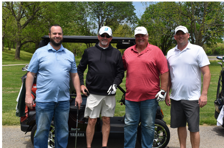
Jack Henry Team at The Arc's Monett Golf Tournament.

jhAVID is focused on disability advocacy, awareness, and inclusion. Members of jhAVID are passionate about disability awareness and often have a personal reason for being part of the group. Some have disabilities of their own or are caretakers of someone with a disability. JhAVID's mission statement is: Advocating for awareness of visible and invisible disabilities while empowering associates' success through education and partnership.