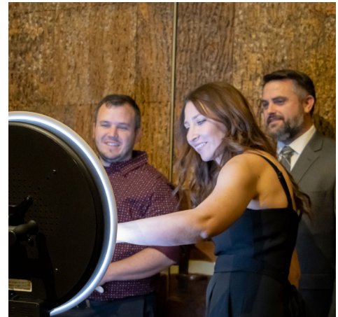
Guests using the selfie booth.

The 29th Annual Christmas Extravaganza Gala was held at the White River Conference Center on December 8, 2023. Thanks to the support of our community and friends, we raised over $113,000 for children's autism services. Proceeds benefited Rivendale Institute of Learning and Center for Autism and the future Autism and Neurodevelopment Center. Guests enjoyed live music, a silent and live auction, and dinner. We are grateful to businesses who donated items to make our auction the most successful it has ever been. Thank you to our underwriting sponsor, Alps Pharmacy, and presenting sponsor, Central Bank of the Ozarks.