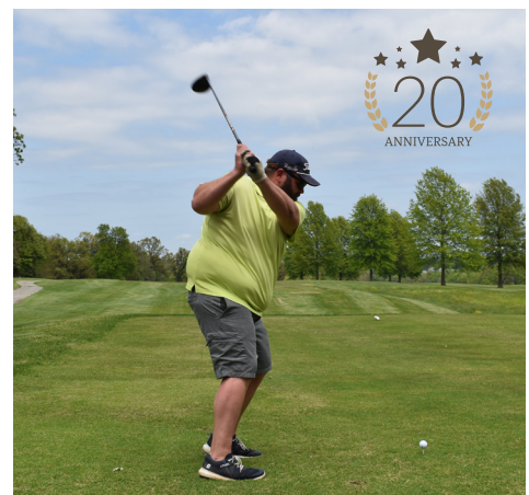
Participant taking a swing.

The 20th Annual Monett Golf Tournament was held on May 5th at Windmill Ridge Golf Course in Monett. We had over 100 golfers who enjoyed a beautiful day of golf to raise funds for a new summer camp for children and an evening educational program for adults with disabilities in Barry and Lawrence counties. The tournament raised over $15,000.