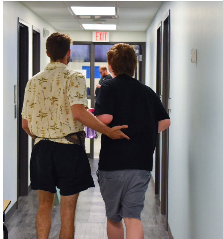
A student and teacher walking through the hallway of Rivendale Institute of Learning.

With the growing prevalence of autism spectrum disorders, The Arc of the Ozarks once again recognizes the urgent need in our community to increase access to comprehensive services and early intervention. In Missouri, the current waitlist for a diagnostic evaluation is one to two years, and treatment services cannot begin without a diagnosis, further delaying a child's development. The solution? Increase access to care by establishing the Autism and Neurodevelopmental Center.