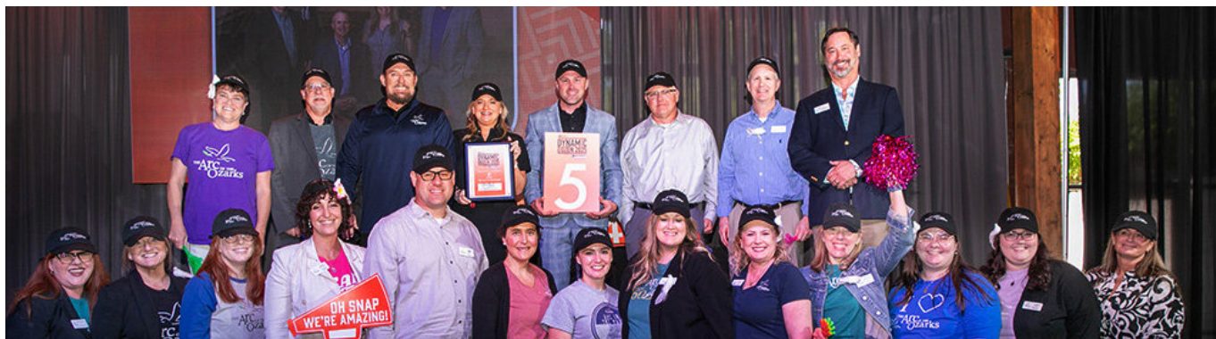
The Arc of the Ozarks team at the SBJ Dynamic Dozen Award Ceremony.