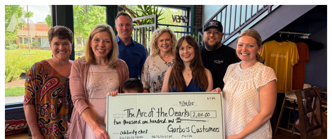
Garbo's Pizzeria donated $2,100 to The Arc's Autism and Neurodevelopmental Center.