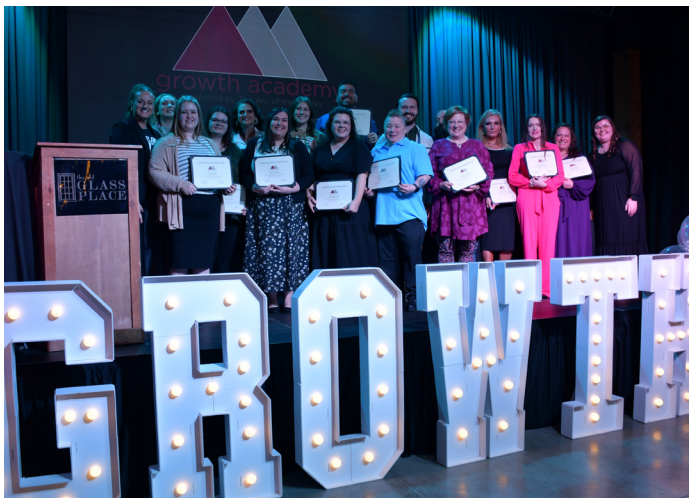
Traditional Trek Graduates.