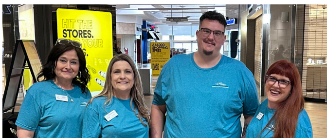
The Arc of the Ozarks Family Advocacy team at the Autism Information Blast.