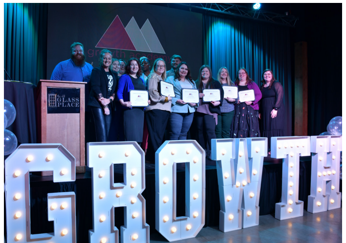
Program Supervisor/Management Trek Graduates.

We extend our deepest congratulations to all of our graduates and honorees. Thank you for your leadership, your passion, and your commitment to enriching lives and building community.